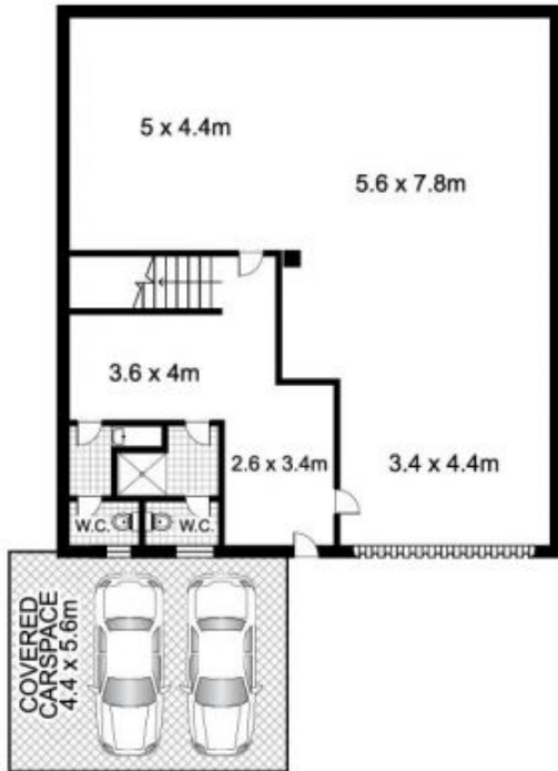
GROUND FLOOR 27/1-3 ENDEAVOUR ROAD