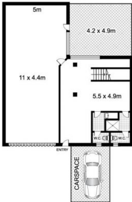
GROUND FLOOR 26/1-3 ENDEAVOUR ROAD