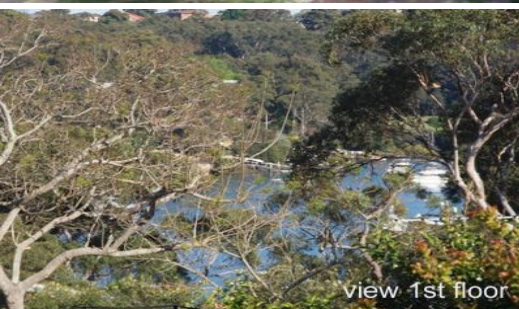
view 1st floor